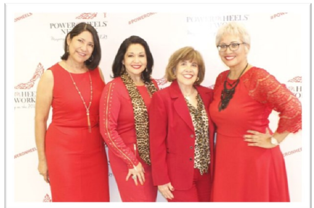
2016 Legacy Mentors